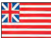
CONTIN. COLORS (GR. UNION)