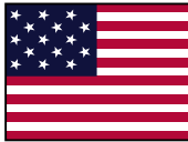
STAR SPANGLED BANNER