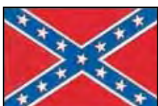
C.S.A. "JACK BATTLE FLAG"

PERMA-NYL® 100% nylon, the flags are all 3' x 5' in size.