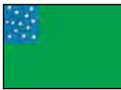
GREEN MTN. BOYS